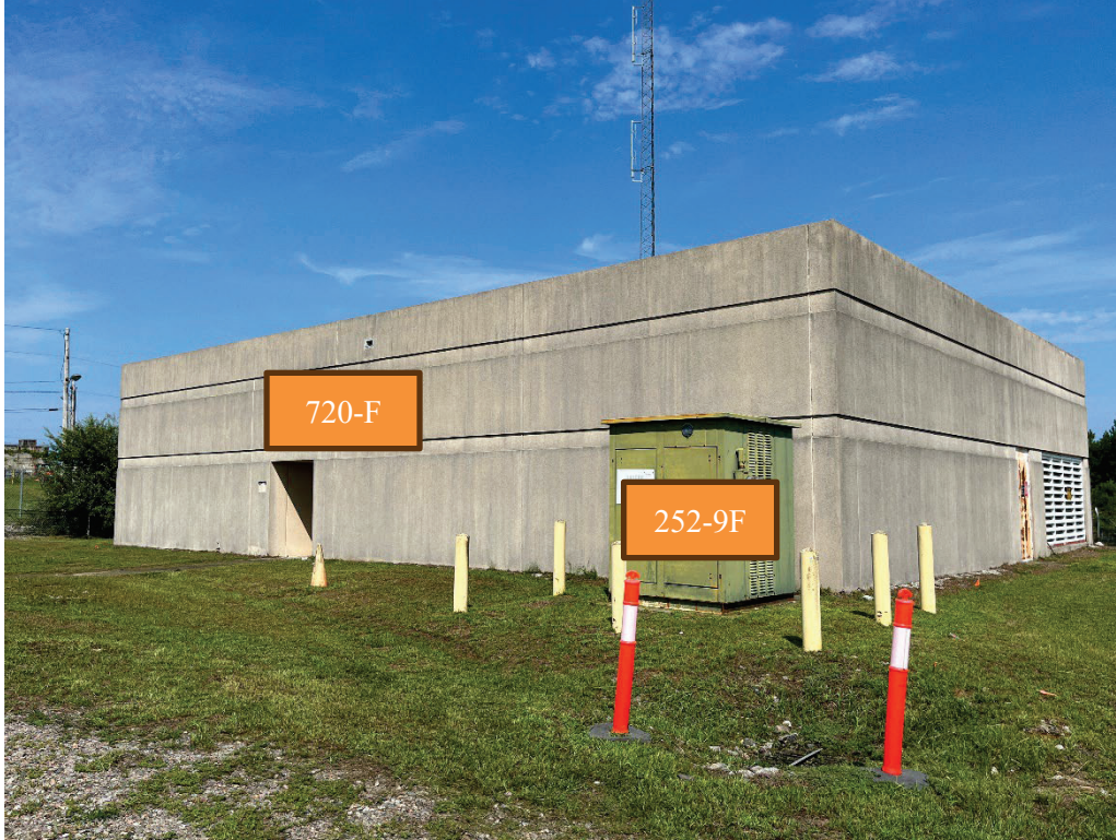
Figure 2: Photograph of 720-F and 252-9F taken from Southeast.