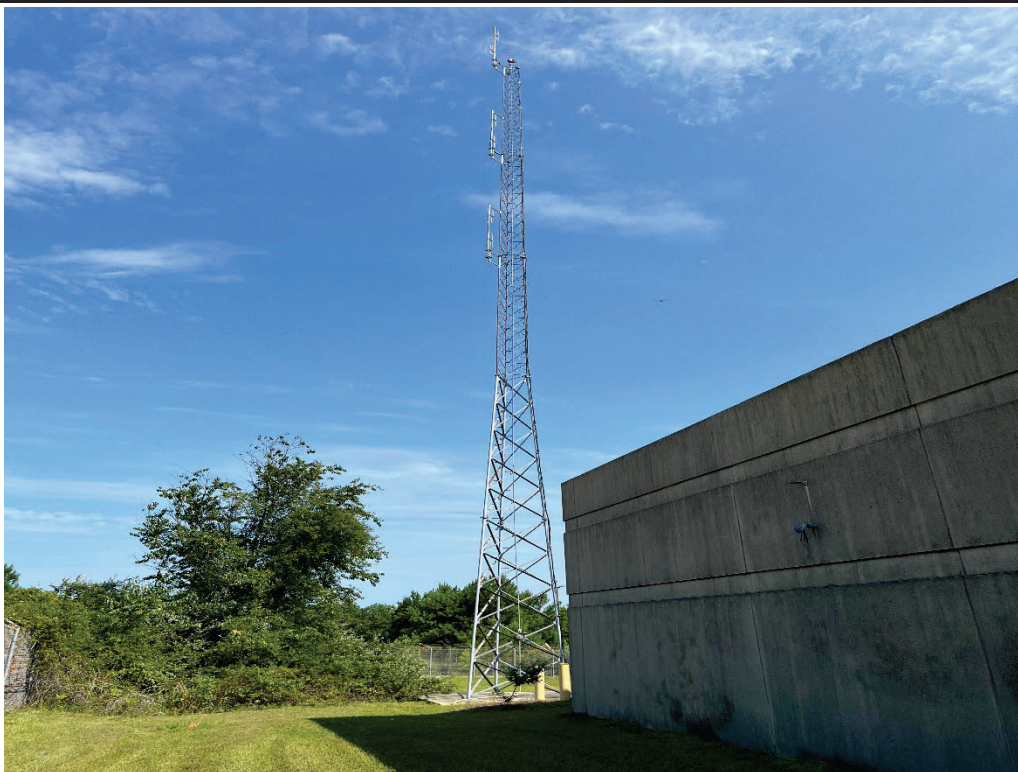
Figure 6: Radio Tower For CAS.