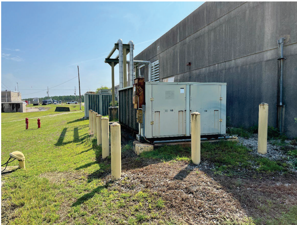
Figure 5: North Side of CAS Featuring the A/C Units and Slabs.