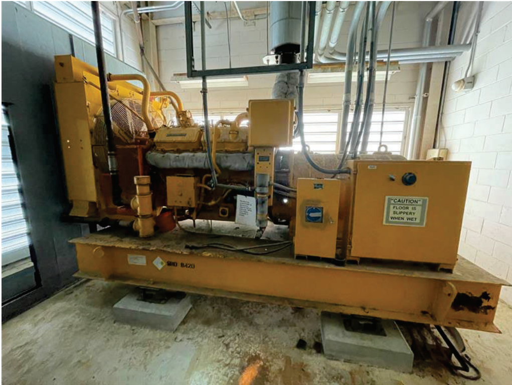
Figure 4: Diesel Generator within 720-F.