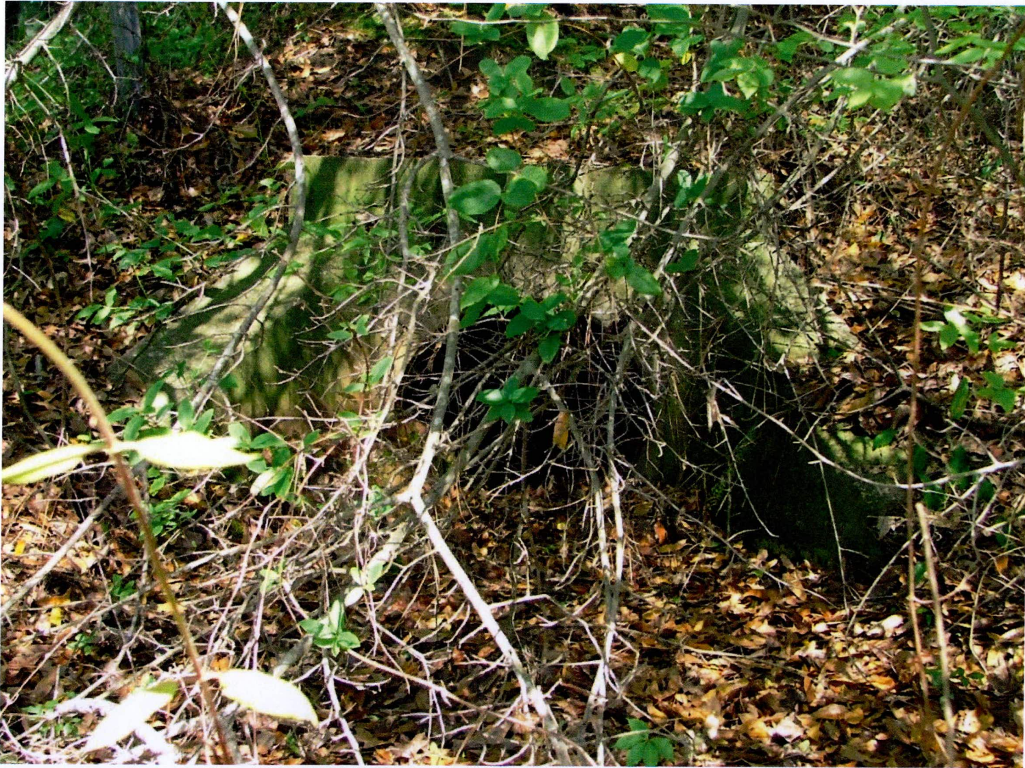
Figure 2. Photo of Stormwater Outfall A-013 (2010)