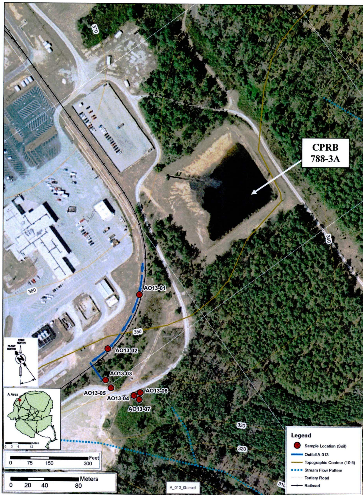
Figure A1. Phase 1 and Phase 2 Sample Locations at Stormwater Outfall A-013