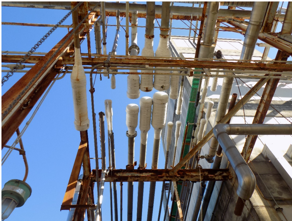
Photo 1 - Pipe Caps/Wraps Only

On Thursday, January 27, 2022, EC&ACP Engineering and EC&ACP D&D Area Projects Integration performed a walkdown of the pipe bridge and west side of Building 221-1F, A-Line, to examine the pipe ends and associated caps and wraps that had been identified in the referenced documents. Although some pipes may have been missed or were difficult to photograph due to the distance from them, every effort was made to photograph each pipe that was capped and wrapped along with every pipe tap. Results of the walkdown are shown in Photos 1-11.