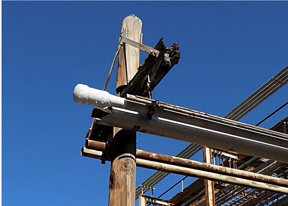
Photo 4 - Pipe Cap/Wrap Only