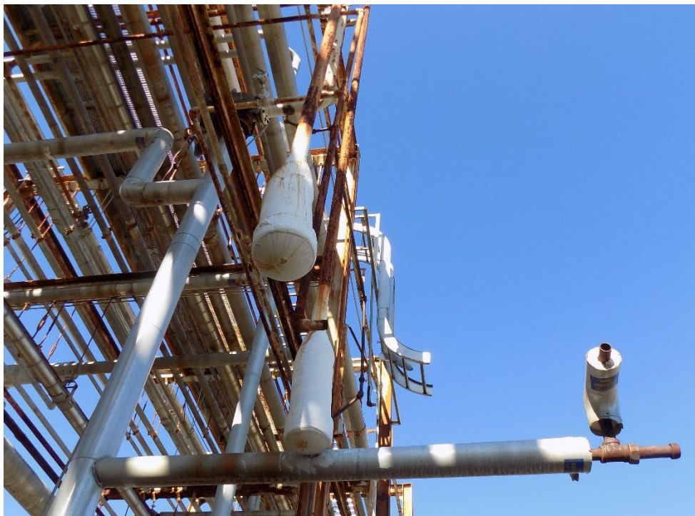
Photo 3 - Pipe Caps/Wraps Only