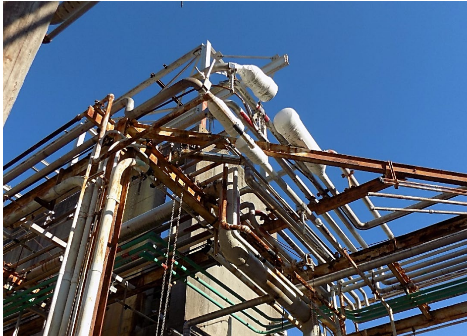
Photo 5 - Pipe Caps/Wraps and Pipe Taps