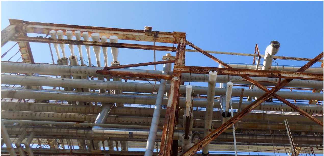
Photo 2 - Pipe Caps/Wraps Only