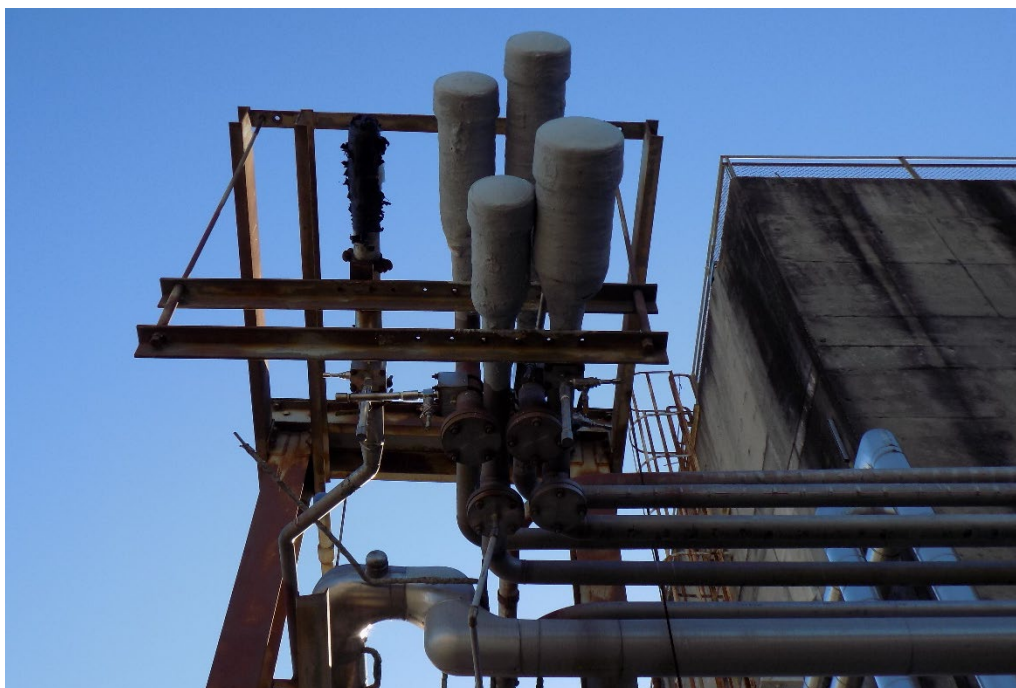
Photo 9 - Pipe Caps/Wraps and Pipe Taps