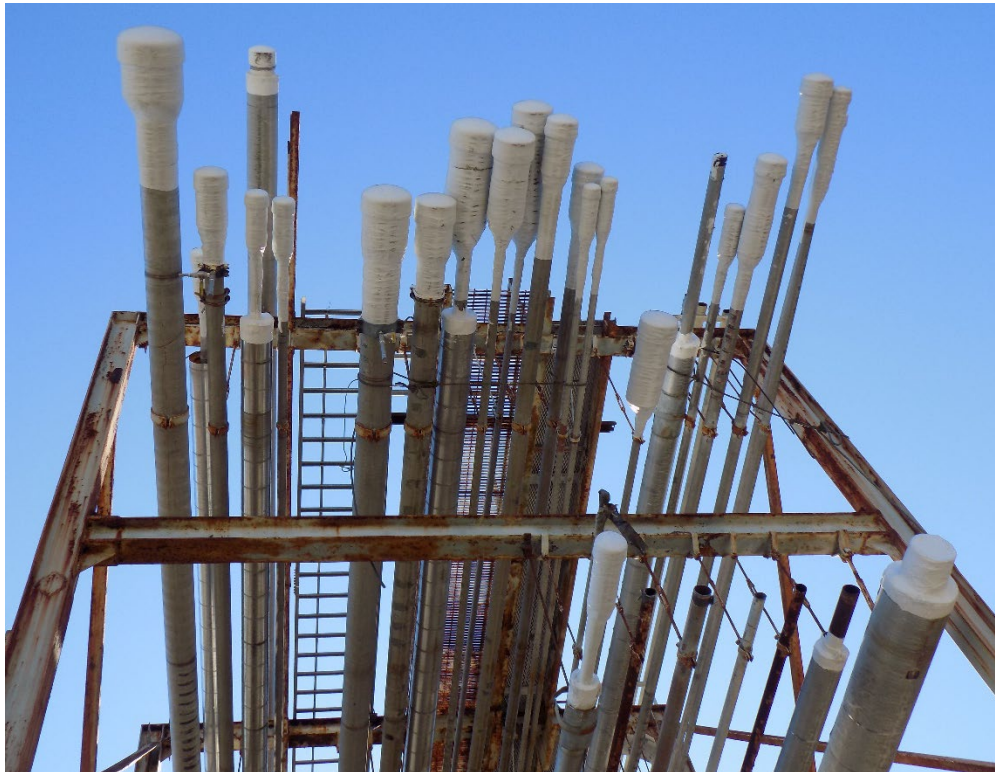
Photo 8 - Pipe Caps/Wraps and Pipe Taps