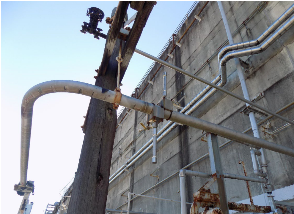
Photo 10 - Pipe Tap Only