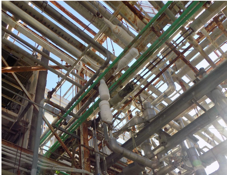
Photo 6 - Pipe Caps/Wraps and Pipe Taps