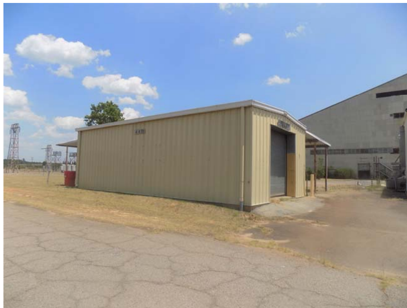
Figure 1. Building 484-7D, D-Area Storage Building

Abutting the covered lay-down are a gravel/dirt and a smaller uncovered concrete lay-down area (Figures 2 and 3). These areas were used for temporary storage of powerhouse parts and equipment suitable for outside storage. The covered laydown area on the south side of the building is currently being used for temporary storage of tools, equipment, cabinets, etc. that belong to the Community Reuse Organization (CRO). All items in temporary storage will be removed prior to decommissioning. The bollard on the southwest corner of the structure will also be removed during decommissioning.