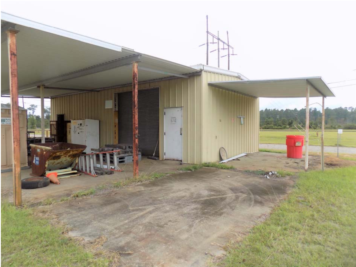
Figure 4. Building 484-7D, Storage Building Covered Lay-down Areas