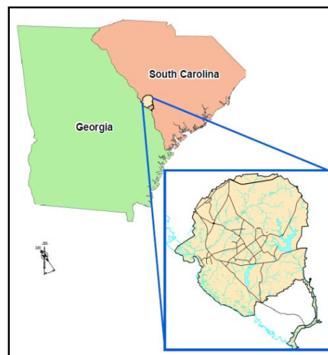
Figure 1. SRS General